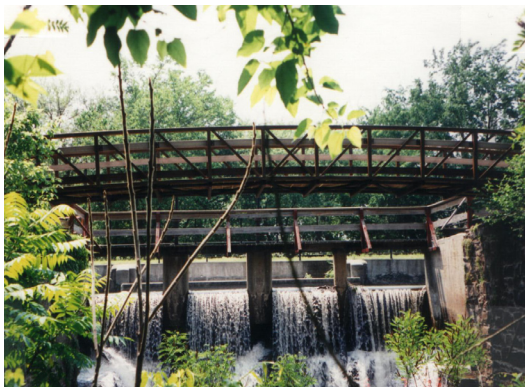
A view of the completed pedestrian bridge with canal overflow to Swan Creek below.