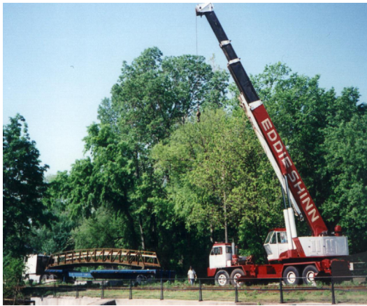
The new bridge being delivered.

LAN LAN ASSOCIATES ENGINEERING PLANNING ARCHITECTURE SURVEYING, INC. WWW.LAN-NJ.COM